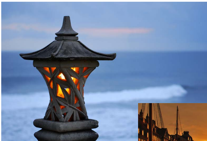
Some student's images