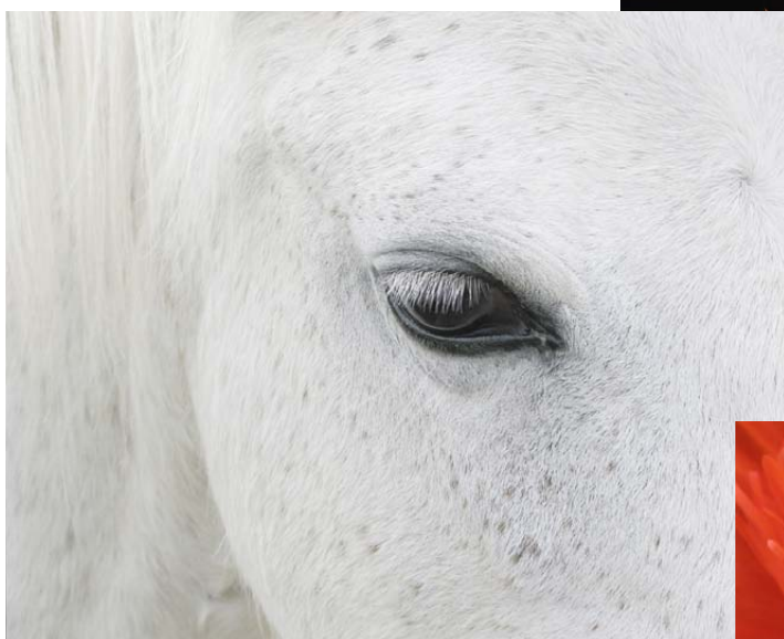
You too can produce images like these...